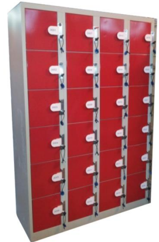
COIN KEY LOCKER