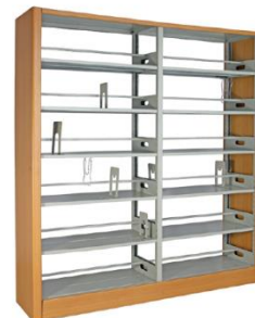
IR-IT02 with wooden finish