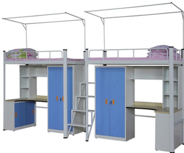
BED with filing system