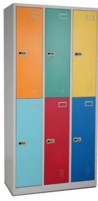
6-DOOR SCHOOL LOCKER